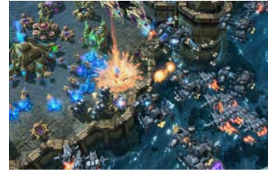
COMPSCI 111 - Lecture 17